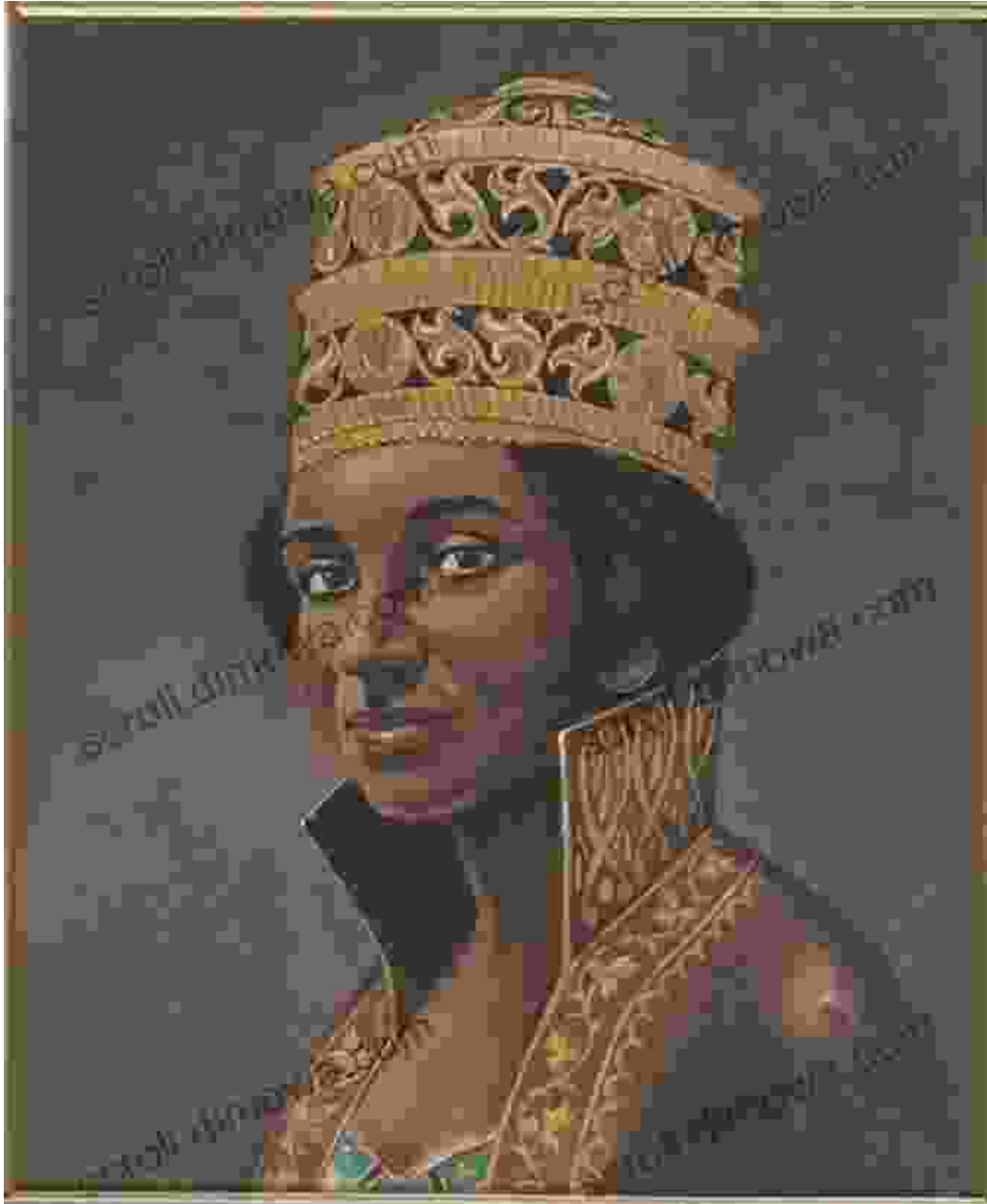
image in African culture, from ancient Ethiopian manuscripts to contemporary Afrofuturistic works. He explores the ways in which her story has been used to celebrate African heritage, promote cultural identity, and challenge prevailing stereotypes.