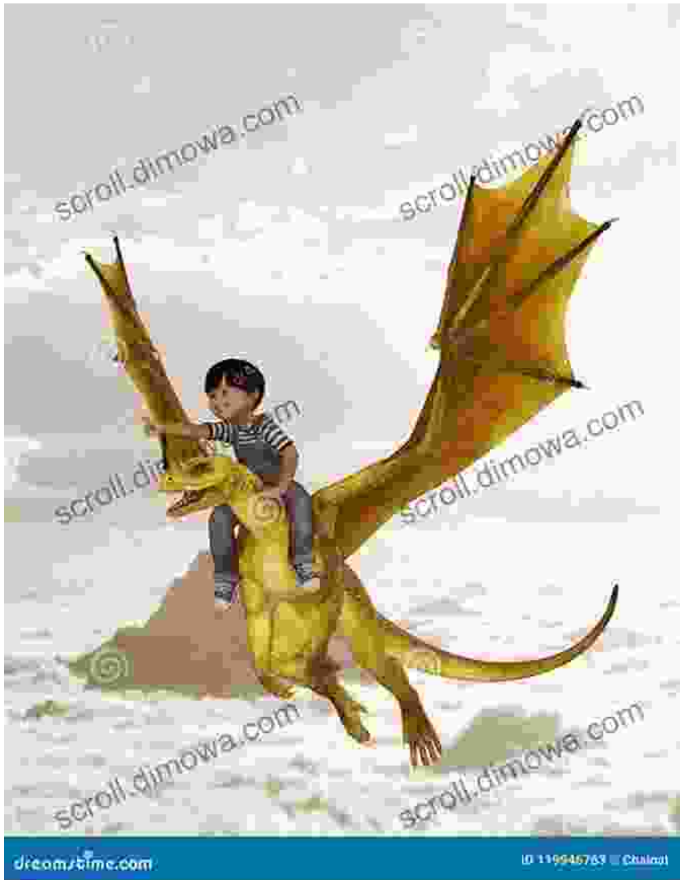
Allie Oops riding on the back of a dragon

As the sun began its descent, casting a golden glow over Imaginationville, Allie made her way to the top of a hill overlooking the town. With a deep breath, she closed her eyes and listened to the symphony of sounds that filled the air. The chirping of crickets, the hooting of owls, and the gentle rustling of leaves created a magical lullaby that soothed her soul.